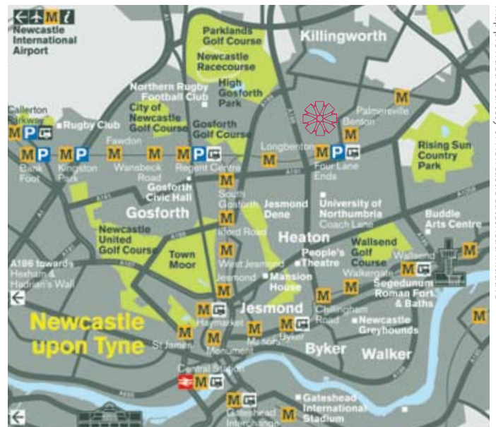
Map provided courtesy of NewcastleGateshead Initiative

Quorum is served by a number of bus routes from across the area, including the dedicated Quorum shuttle bus link. Over 1,000 bus services per day call at the nearby Four Lane Ends Interchange. Contact our Travel Coordinator at the Hub for more details on timetables.